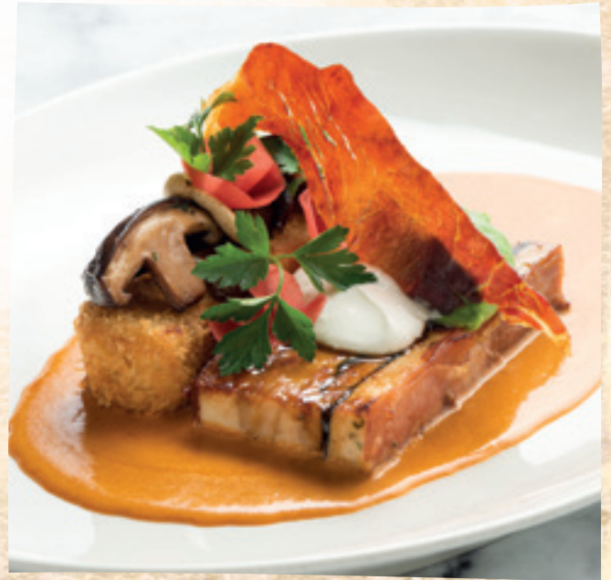
Pressed chicken "Bakony" style with roasted shiitake mushrooms and ewe's cheesy potato noodles in crispy coat