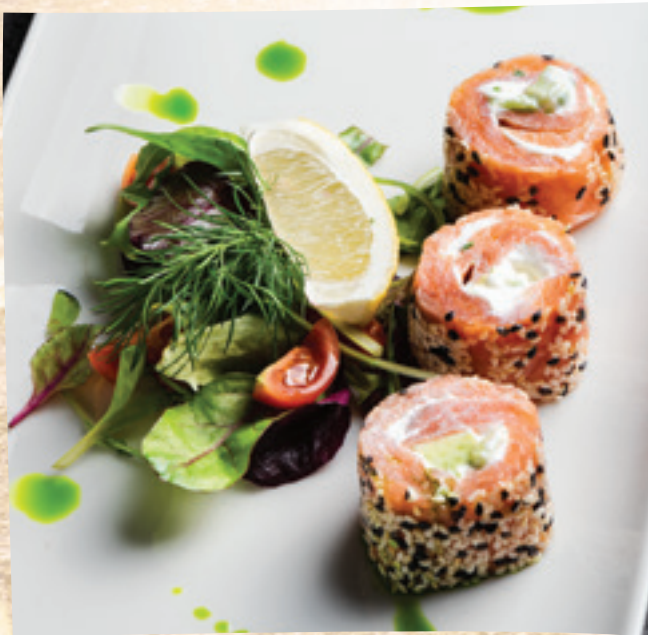
Sesame seed covered smoked salmon roll stuffed with avocado and cream cheese cucumber