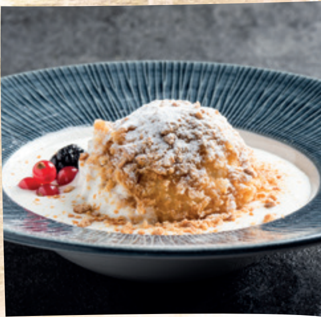
Cottage cheese dumpling with macaroon flavoured sour cream