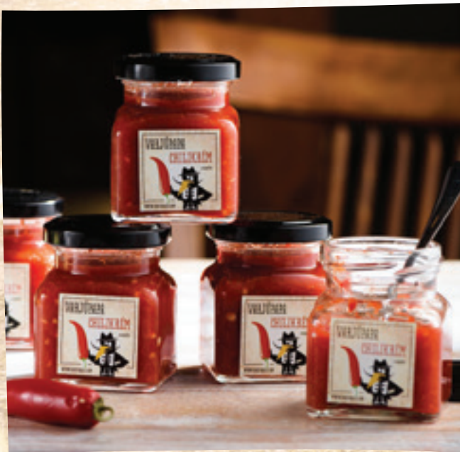
VarjúPapa chili cream: 1 990 HUF/piece