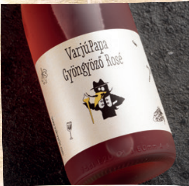
VarjúPapa's rosé wine 4 290 HUF/bottle/take away