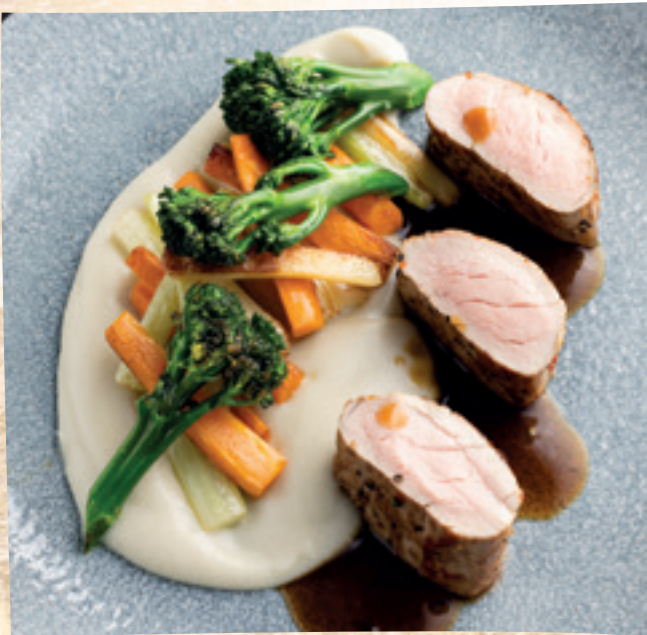
Pork tenderloin in pepper crust with smoky artichoke puree, wild broccoli and roasted root vegetables