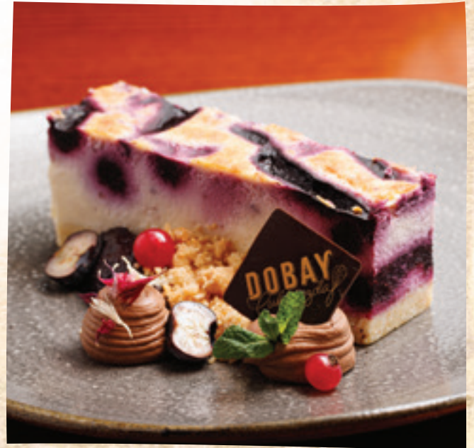
Blueberry cheesecake with almond crumbles, chocolate ganache, and blueberry coulis