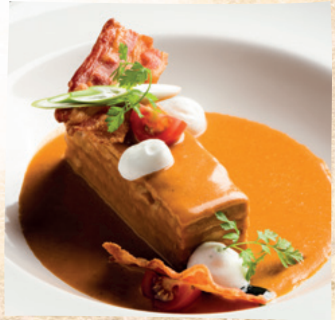
Stuffed crepe "Hortobágy" style