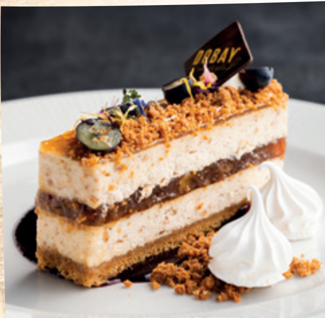
Fig-pecan mousse with gingerbread, blueberry coulis and caramel crumble