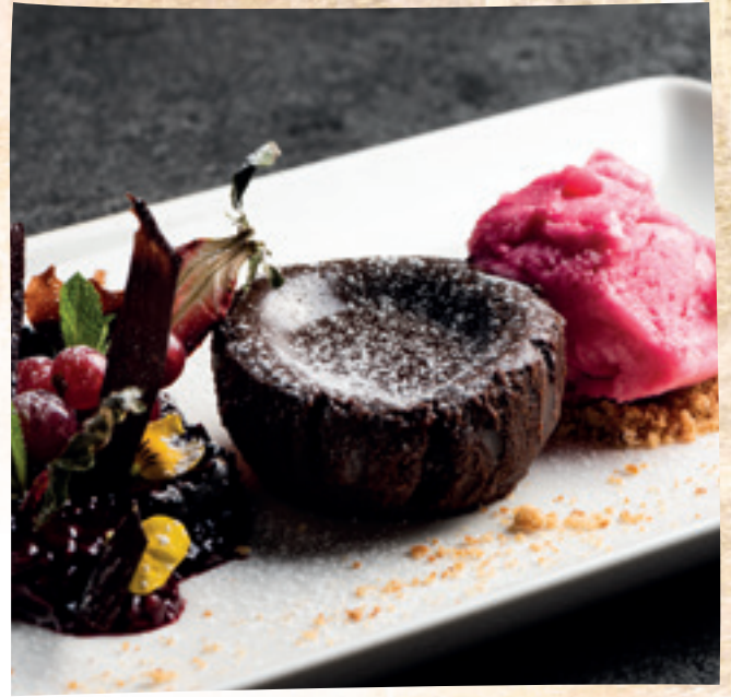
Chocolate soufflé with raspberry ice cream